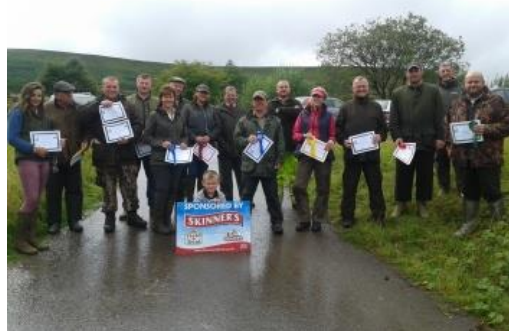
Puppy & Novice Winners