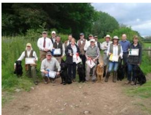
NDNH & Open Awards Winners and Judges