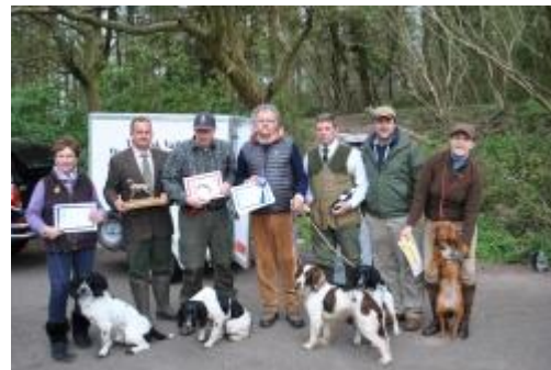
Open Award Winners and Judges