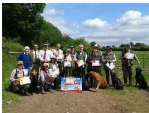
Puppy and Novice Award Winners and Judges