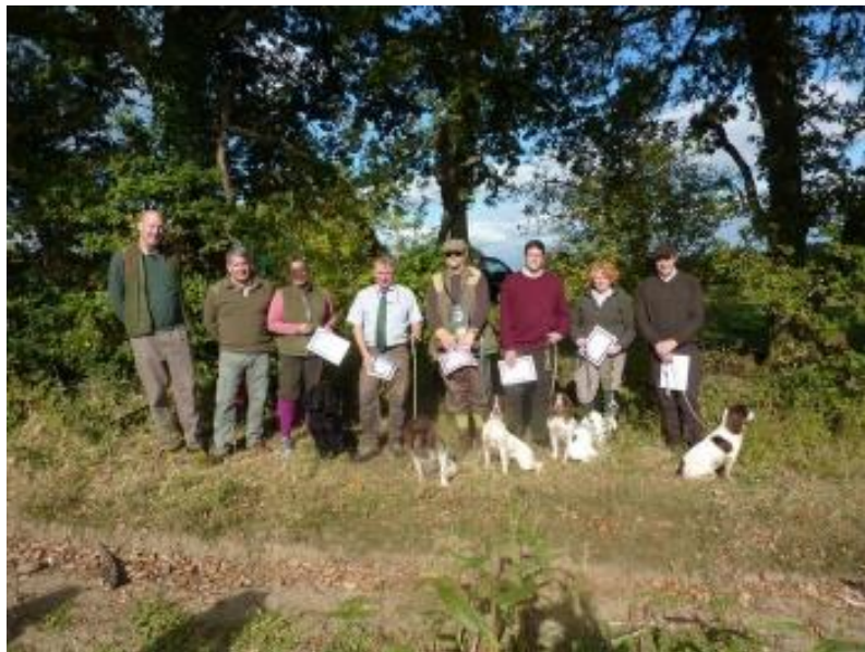
Award Winners & Judges