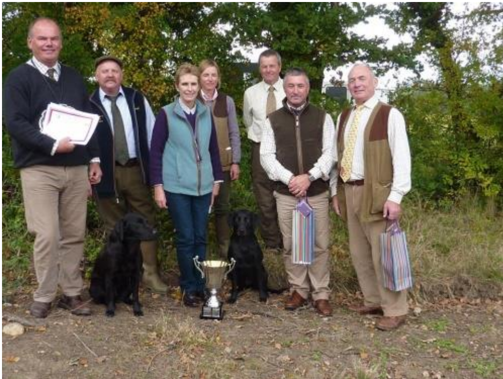
Stake 2 Award Winners & Judges