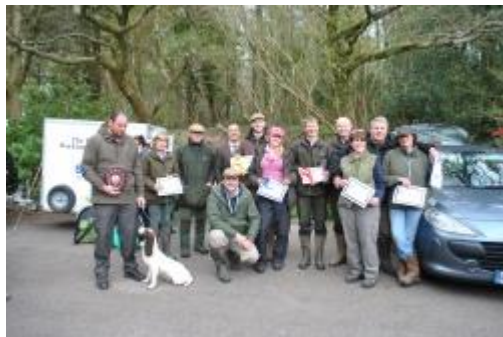
Puppy & Novice Award Winners and Judges